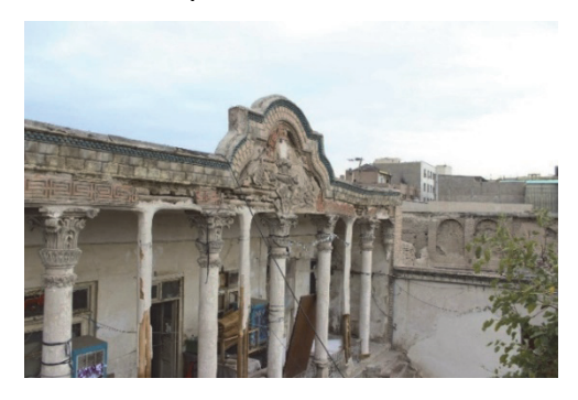
Fig .1: Oodlajan residential architecture Chopani St.

This proposal tries to survey the effects of modernism, urbanization and globalization on one of the olden locale of Tehran and tries to probe the issue as far as it can.