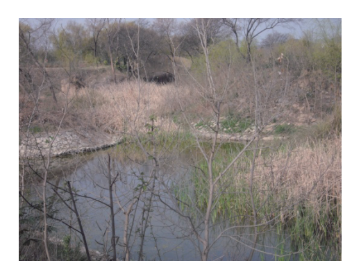
Fig 3: (Left). Perennial stream and water harvesting cascades

The more important aspect of original concept and later interventions was the continuity of the idea of symbiosis between man and nature. In fact, the use of water, rocks and plants have been used in an intelligent manner without being dominating the man made intervention over the nature. Bridges over the perennial streams at different intervals united the different landscape zones with one another. The varying width of streams at interval helps to retain water in non rainy seasons to promote water harvesting. At the same time a number of collection ponds of rainwater harvesting have been constructed all over the park. The waterscape is further strengthened by the construction of the series of waterfalls either at the change of levels or building artificial mound lined with raw stones. In this way the water falls have been given a more natural look. The idea of use of waterfall has been derived both from the Japanese as well as Kashmiri landscape tradition [3].