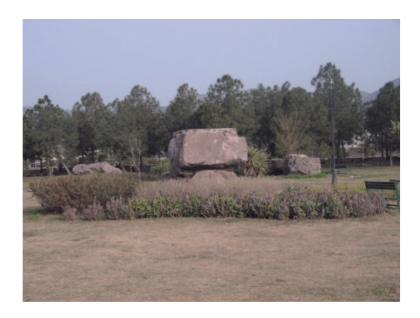
Fig.2: (Right): Use of natural rocks

The more important aspect of original concept and later interventions was the continuity of the idea of symbiosis between man and nature. In fact, the use of water, rocks and plants have been used in an intelligent manner without being dominating the man made intervention over the nature. Bridges over the perennial streams at different intervals united the different landscape zones with one another. The varying width of streams at interval helps to retain water in non rainy seasons to promote water harvesting. At the same time a number of collection ponds of rainwater harvesting have been constructed all over the park. The waterscape is further strengthened by the construction of the series of waterfalls either at the change of levels or building artificial mound lined with raw stones. In this way the water falls have been given a more natural look. The idea of use of waterfall has been derived both from the Japanese as well as Kashmiri landscape tradition [3].