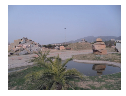
Fig. 4: (Left). Use of stones in

The most important aspect of landscape design is the use of rocks in the natural manner. The rocks have been successfully used for the first time in Pakistan in this park. This particular feature clearly took inspiration from the Japanese tradition. The rocks and pebble stones have been used in parking areas, steps or simply arranged in a natural manner. A variety of shapes of rocks depicting movement, calmness and progression and development create liveliness in the natural environment.