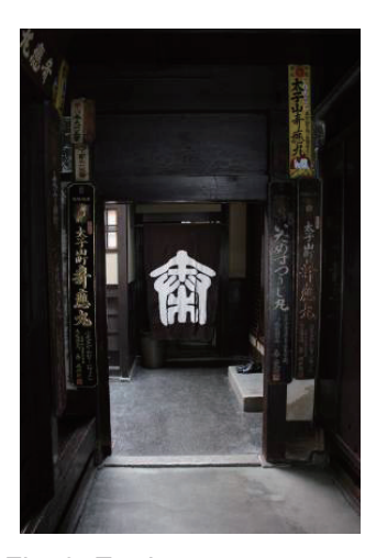
Fig. 9: Earthen passageway Fig. 10: Sliding fittings. Imagine the connection to scenes