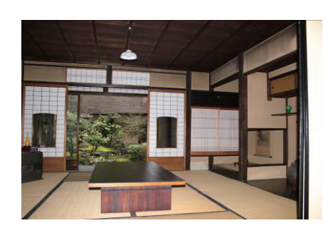
Fig. 11: Alcove and shelf as asymmetry elements right-side of room

• The basic space of a kyo-Machiya townhouse is configured in double spaces, earth-floored passageway and tatami-floored residence area and, furthermore, asymmetry is apparent in the configuration of both spaces. The space of the main tatami-mat rooms (zashiki) and the inner garden are emphasized asymmetrically by the building elements, the alcove and the shelves in the tatami-zashiki and the open veranda that extends from these rooms in the inner garden. Moreover, the positions of the building elements both spaces are reversed. The further effect of the movement reversal is cleverly interwoven into the dynamic sensation of asymmetry (Figs. 11and 12).