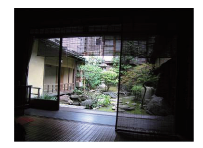
Fig. 12: Open veranda on left-side of inner garden