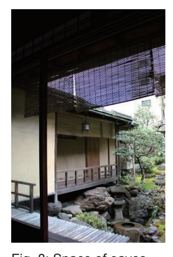
Fig. 8: Space of eaves connection to inner garden

• A lattice at the front and translucent sliding screens also effectively create a casually sense of the path ahead because of semi-transparent effect.