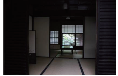
Fig. 2: Latticework inside Fig. 3: Dimness = spatiality as hazy