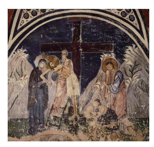
4 Descent from the Cross