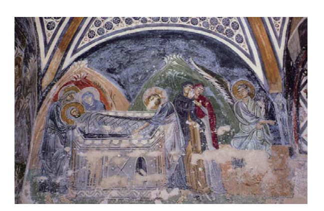
5 Entombment and the Women at the Empty Tomb