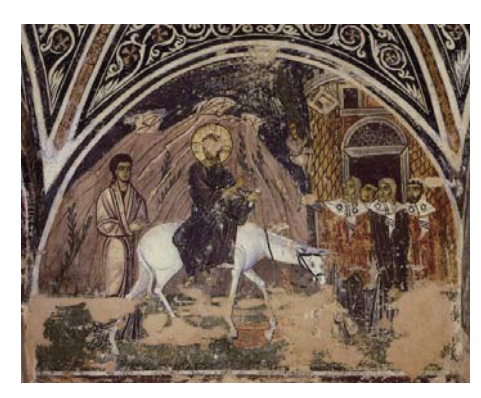
2 Entry into Jersalem