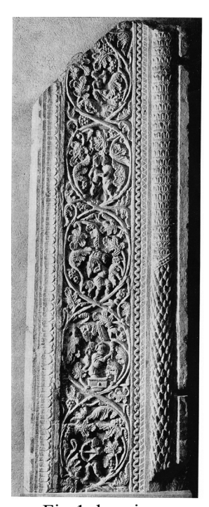
Fig.1 door jam