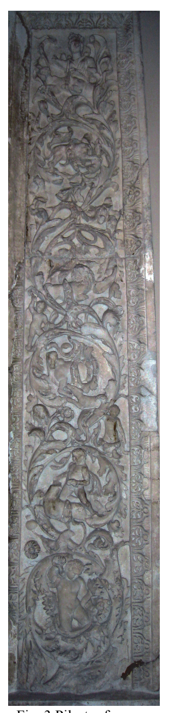
Fig. 3 Pilaster from Aphrodisias

On a pilaster of the tetrapylon at Leptis Magna, peopled vine scroll is depicted. The type of this vine scroll is the same as the second type above mentioned. In the medallions are depicted human figures related to Dionysus and the Greek Gods such as Heracles. What is more, peopled acanthus scroll is depicted on pilasters of