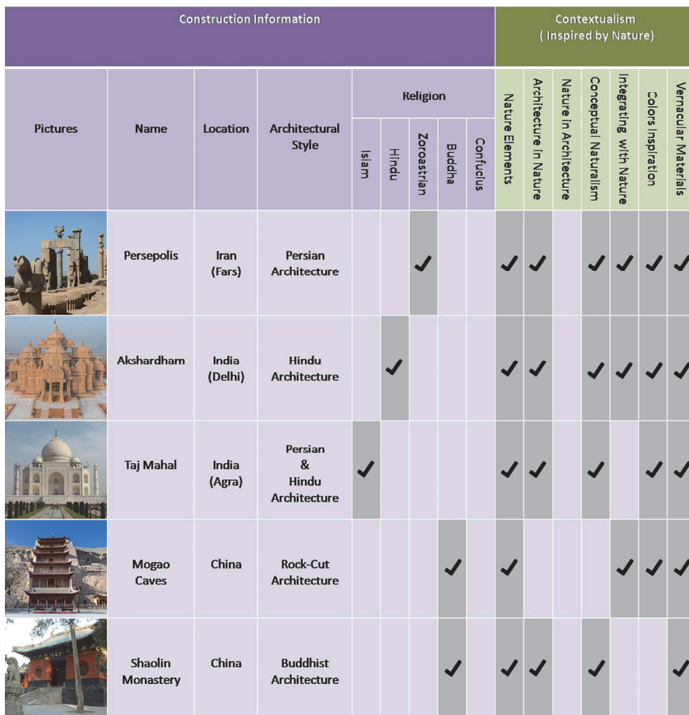
Table 2: Nature inspiration in architecture, designed by authors

The following paper, shows the interaction among humans and nature in eastern culture. To reach the answer of how much the nature has been affective in architecture, 20 samples of the remarkable architecture, have been selected and all the cases of the architectural monuments of the countries beside the silk road that the eastern culture has had a resounding role in forming them. Following table show some of these samples.