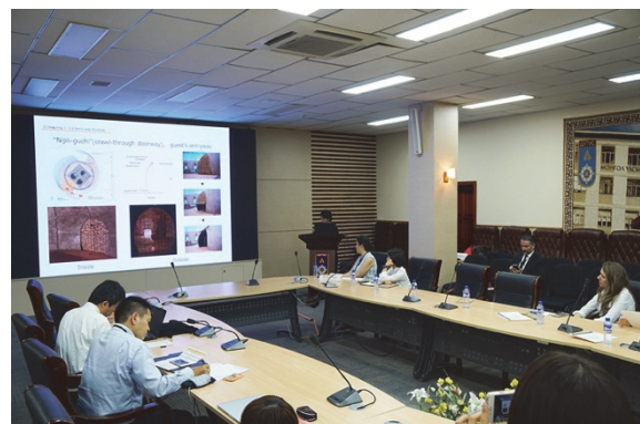
Presentation of student of MWU master program “Tea Ceremony Room “SASARA-AN” Full Scale Structures Using Shell”