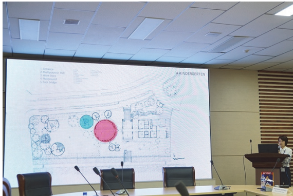
Presentation of undergraduate student of MWU

In the morning, “Project Presentation” were given by students of MWU and MUST. They introduced their architectural projects. After lunch break, session on “Digital approaches,” “Urban and rural practices,” and “Cross-cultural interactions in art and design” were held.