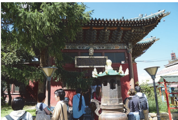
Buddhist temple of Gandan monastery