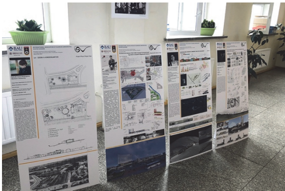
The poster made for the Project Session by MWU and MUST students