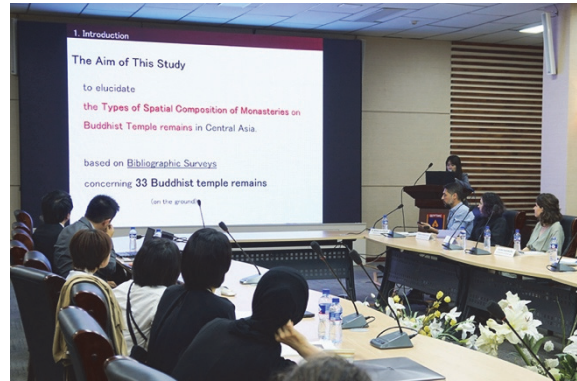
Presentation of academic staff of MWU