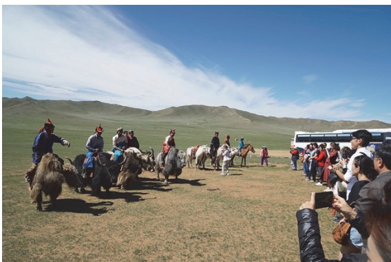
Meet with Mongolian Nomads who came over from the gel built on the grassy plain, riding the domestic animals such as horses, yaks and camels