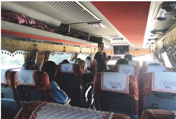
Beginning the cultural trip via the Bus

The three-day international conference thus successfully concluded. 5 th iaSU was the first holding in the country except Japan and Turkey, was able to have time for very substantial academic interchange.