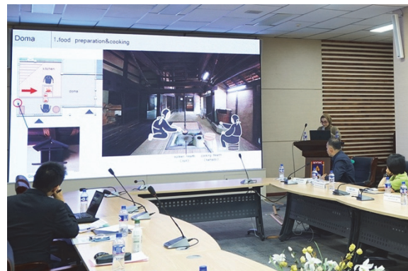
Presentation of student of MWU doctoral program