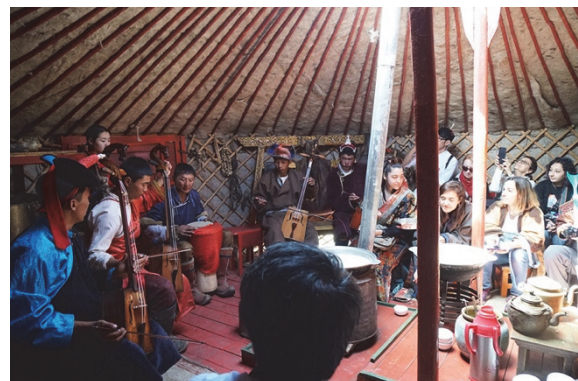
Enjoy the traditional music that Mongolian nomads plain in the Gel