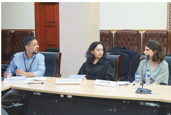
Discussion in session