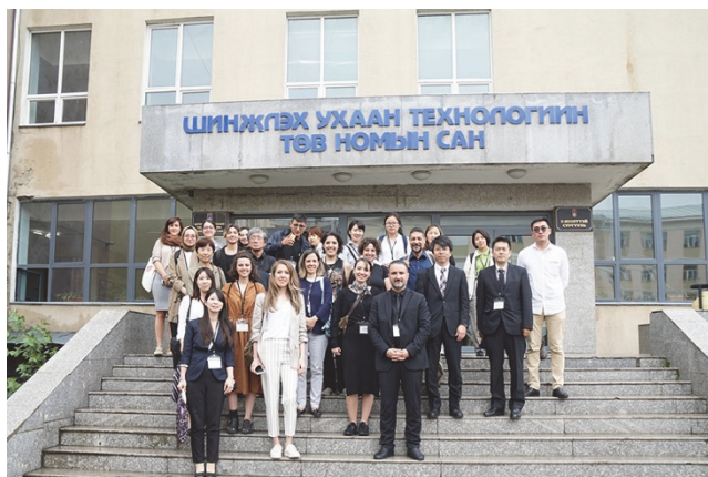
Photo shoot in front of the campus of MUST