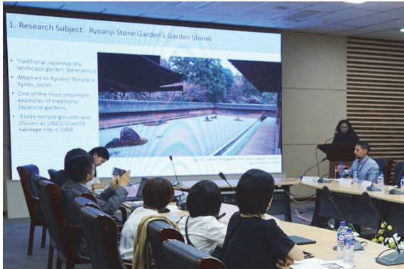
Presentation of student of MWU doctoral program

In the afternoon, sessions on “Sacred & Secular spaces” and “Human & environment relations” were given at the conference. After two sessions, “Project Presentation” were given by students of MWU and MUST. They introduced their architectural project. An active discussion was carried out during the sessions, and the Mongolian students and the Japanese students took the communication positively.