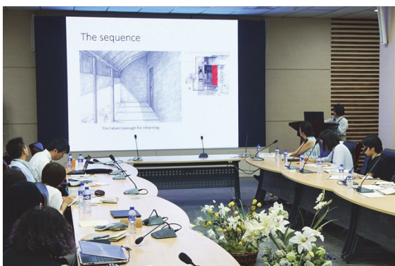
Presentation of student of MWU master program “The Bath House”