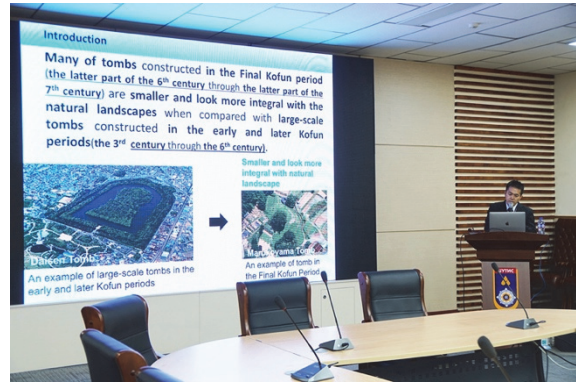
Presentation of academic staff of MWU