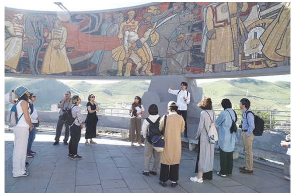
Zaisan Hill where can overlook the Ulaanbaatar city