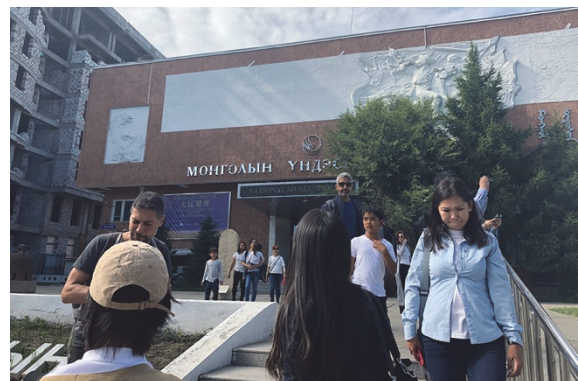
Mongolian National Museum