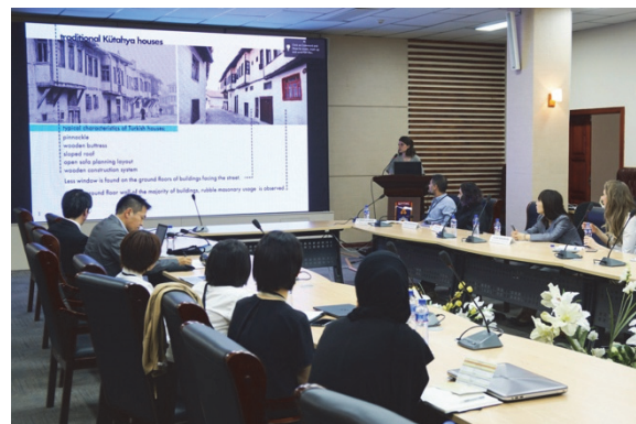
Presentation of academic staff of BAU