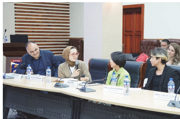
Discussion in Session