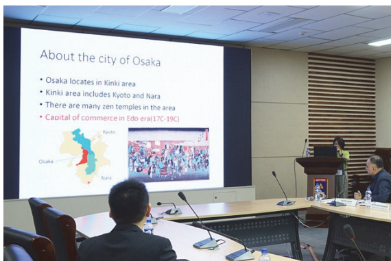
Presentation of student of MWU master program