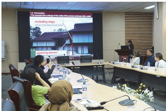
Presentation of academic staff of MWU